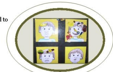
How I feel Today!

Looking forward to hosting you in Izmir-Turkey!