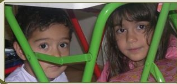
Hide and Seek (under the table)